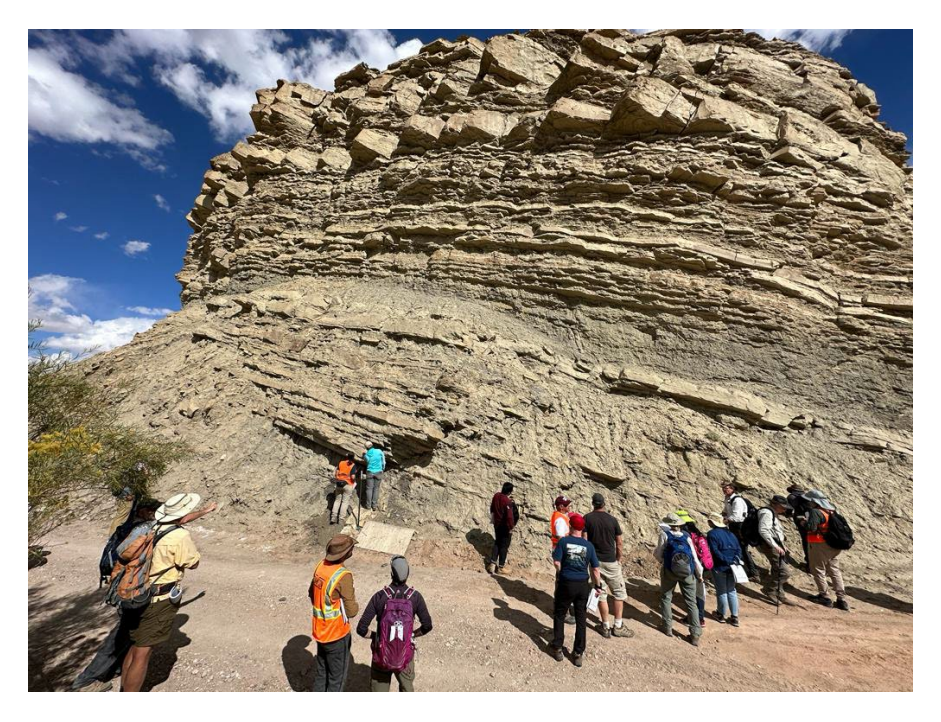
Photo: Day 3 in the field. Janok Bhattacharya talks participants through parasequences in the Notom Delta.

Day 4 kicked off with an early morning outing towards Battleship Butte to view the Kenilworth Member shoreface facies change. The low-angle morning sunshine also provided the perfect opportunity for a group photo (see below).