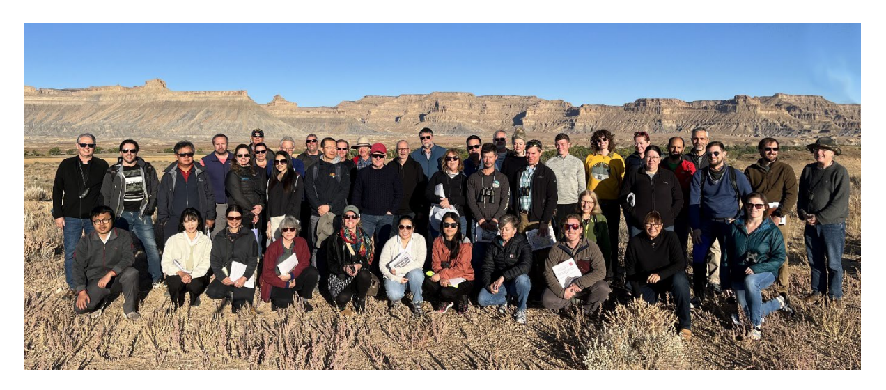
Photo: Day 4 - Participants pose in front of the classic Battleship Butte outcrops near Green River.