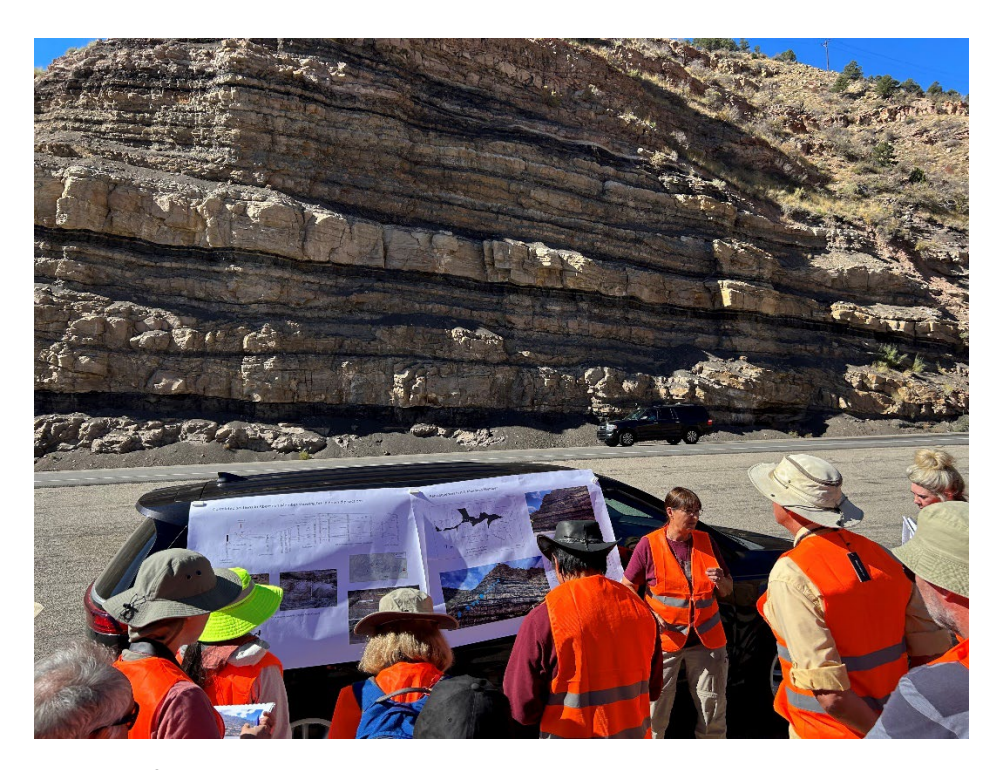
Photo: Day 1 in the field. Diane Kamola talks participants through parasequences in incised valleys.

Day 1 of the Research Conference kicked-off on the morning of October 9 in Salt Lake City with participants gathering and driving out towards Green River with a first orientation stop at the classic Castlegate overview section. Howard Feldman, Janok Bhattacharya, Diane Kamola and Brian Willis provided the field leadership on this first day. The group moved on to view Blackhawk fluvial and marine facies and parasequences before spending time at the classic Panther Tongue outcrops around Price and discussing the internal architecture of parasequences. The day rounded-out with an ice-breaker evening session overlooking the Green River.