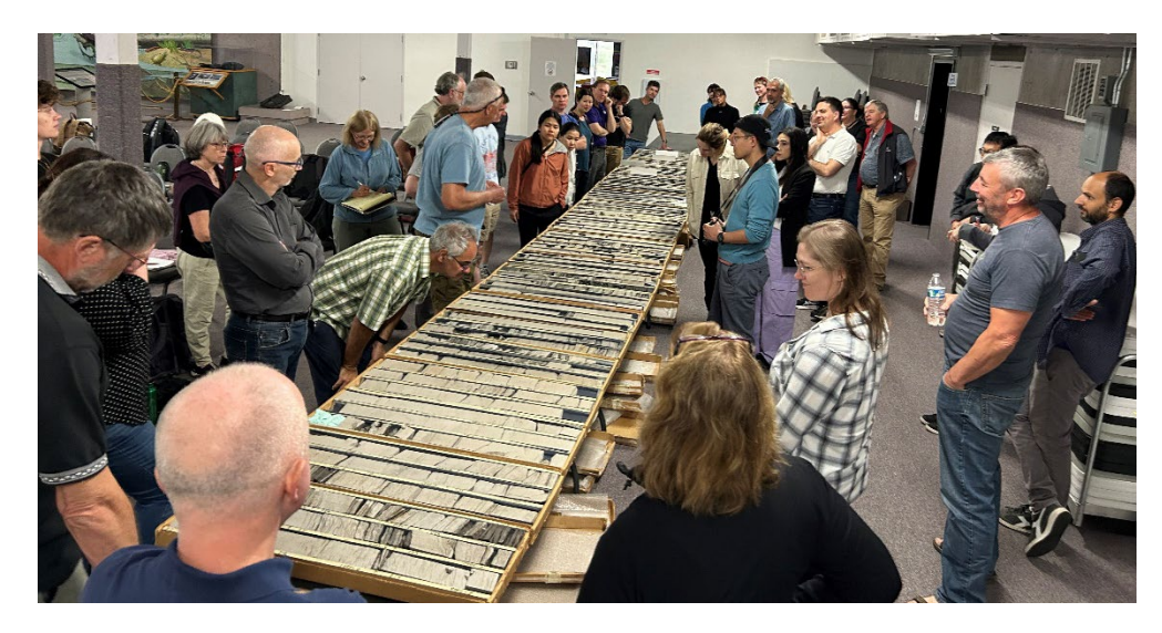
Photo: Day 2 - Participants inspect and discuss the Thompson Canyon, Desert Member core at the conference venue.

An evening outing for the group to view the Floy Canyon to Blaze Canyon face in the setting sun was followed by the conference dinner at Ray's Tavern.