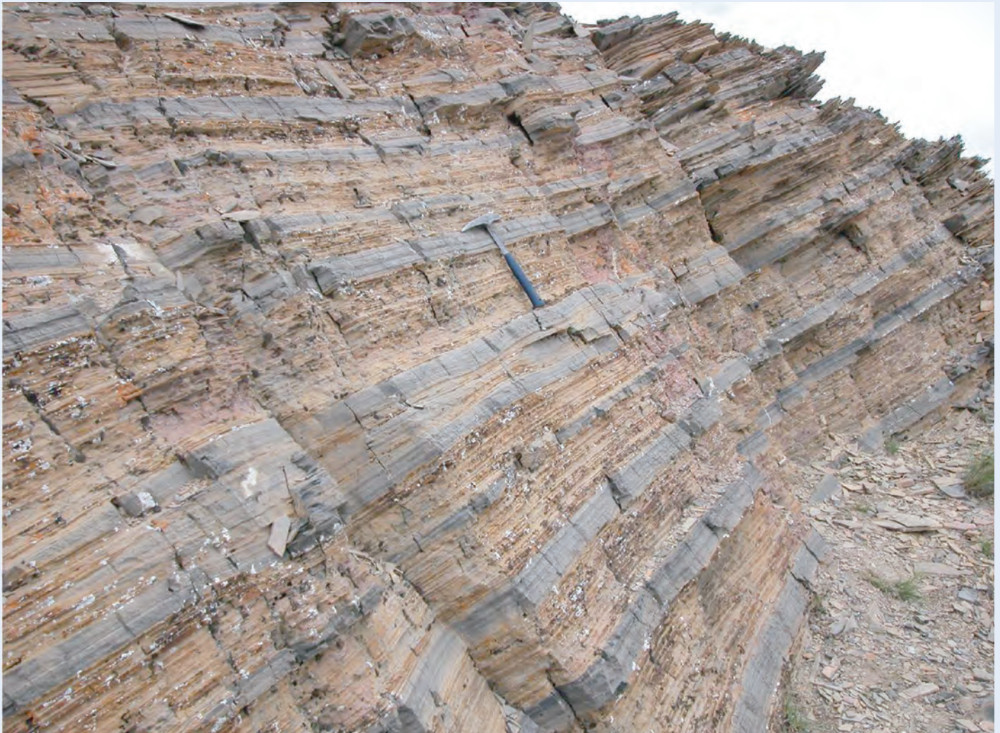
Figure 1: An enigma in the Late Devonian. While several argue that late Paleozoic glaciation began in the latest Devonian (Isaacson et al., 2008), the presence of 10^4 to 10^5 ky stratigraphic cycles in older Devonian successions, such as seen here at Devils Gate, Nevada, suggest the initiation of glaciation and glacioeustasy much earlier in the Devonian (Sandberg et al., 1988).

carbon sequestration efforts, the Earth could soon surpass \text{CO}_2 levels last experienced prior to the onset of our current glacial state 34 million years ago (NRC 2011). If observations of historic changes in climate and ecosystems under rising, but generally low atmospheric \text{CO}_2 levels are any indication, a future high \text{CO}_2 world will be drastically different than today. How different is the critical question. Without a clear analogue for our future, we proceed with great uncertainty with regards to how surface conditions and ecological processes will evolve with continued forcing (Hansen et al. 2008).