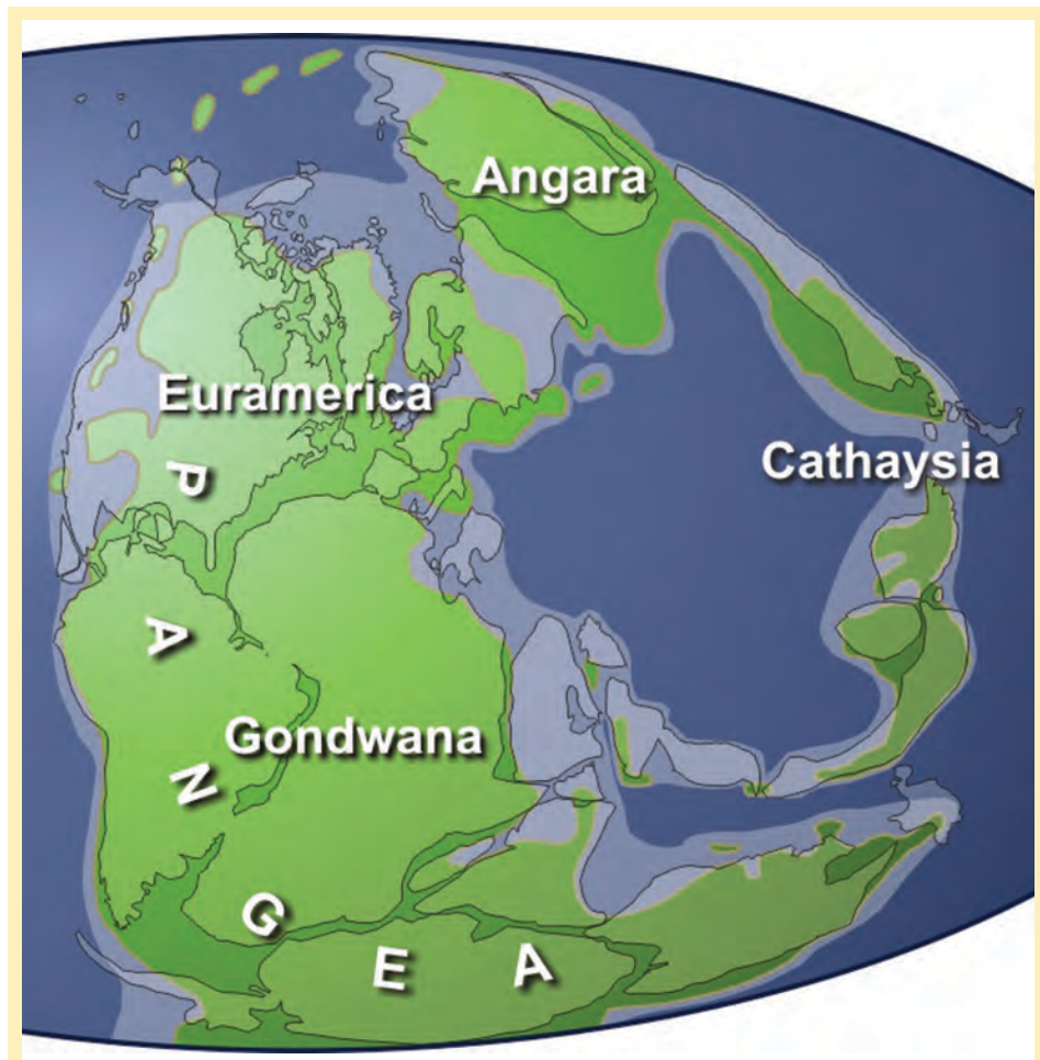
Figure 1: The Late Paleozoic supercontinent, Pangea. Four major floral zones are indicated, tropical Euramerica and Cathaysia, and temperate Angara and Gondwana. Paleogeography after Scotese (1997)

There are other important taphonomic factors that strongly influence interpretation of the land-plant macrofossil record (Gastaldo and Demko 2011). Taphonomic