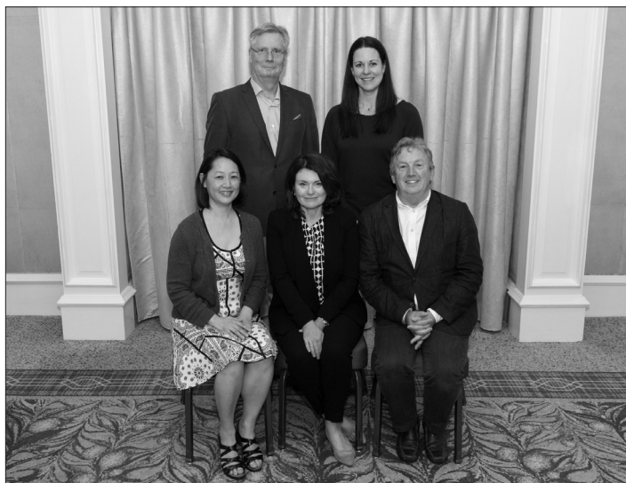
SEPM 2017 – 2018 Council